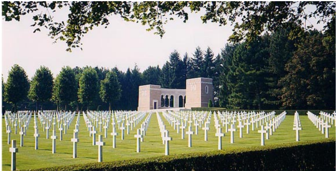
15. Oise-Aisne, France. A total of 6,012 of our military dead.