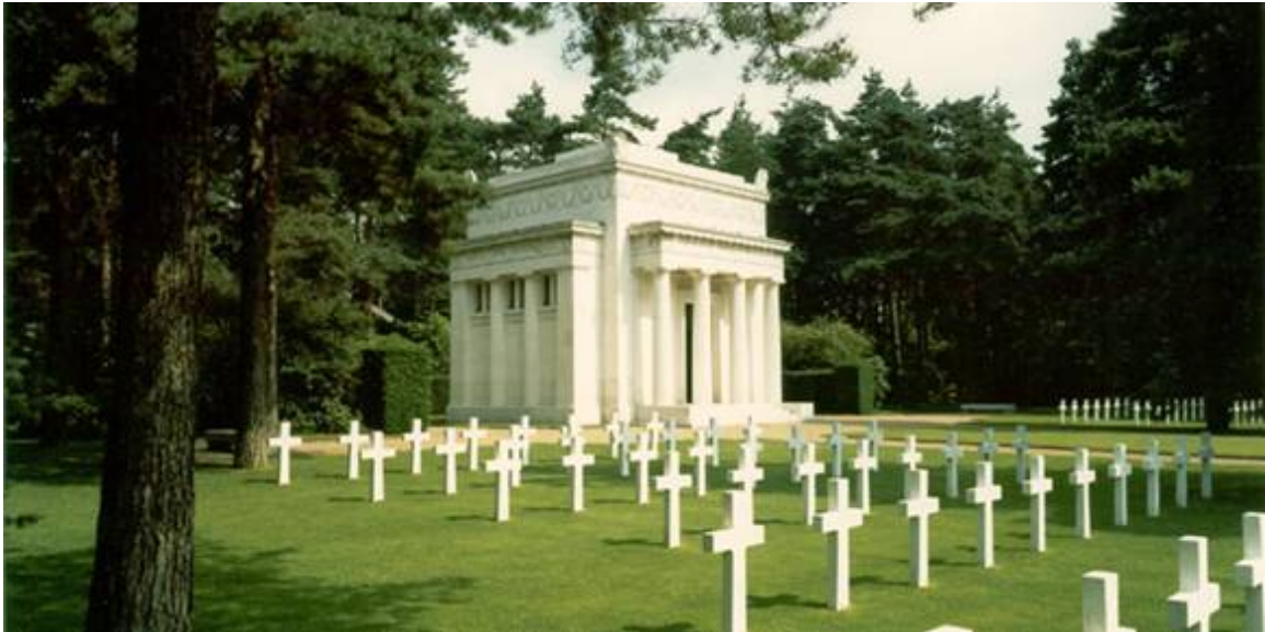
5. Cambridge, England. 3.812 of our military dead.