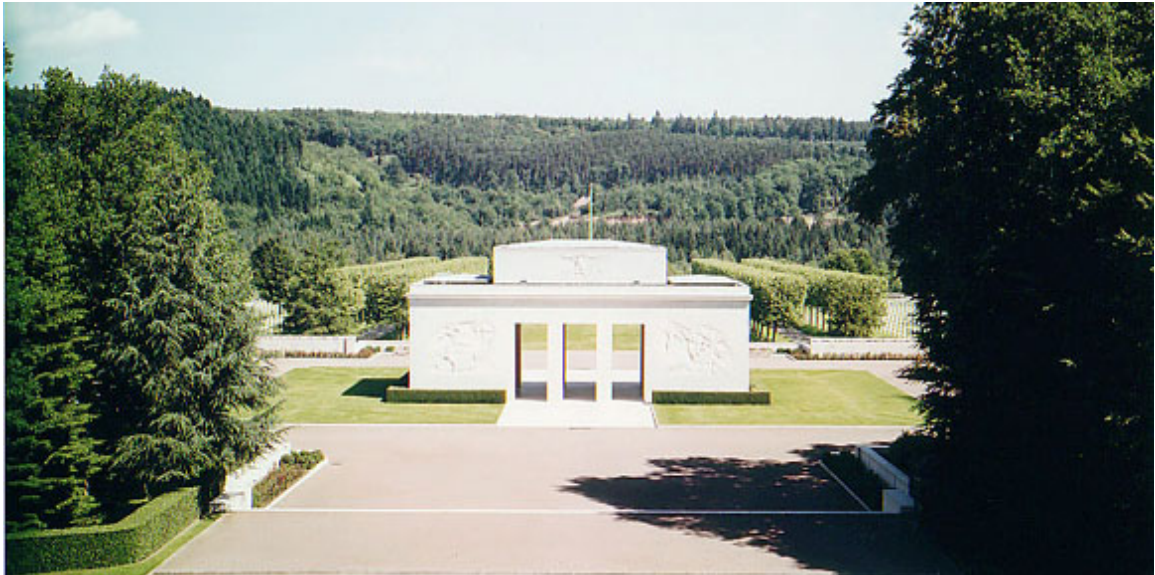
7. Flanders Field, Belgium. A total of 368 of our military