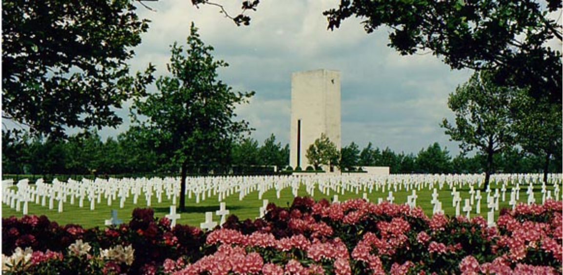
14. Normandy France. A total of 9,387 of our military dead