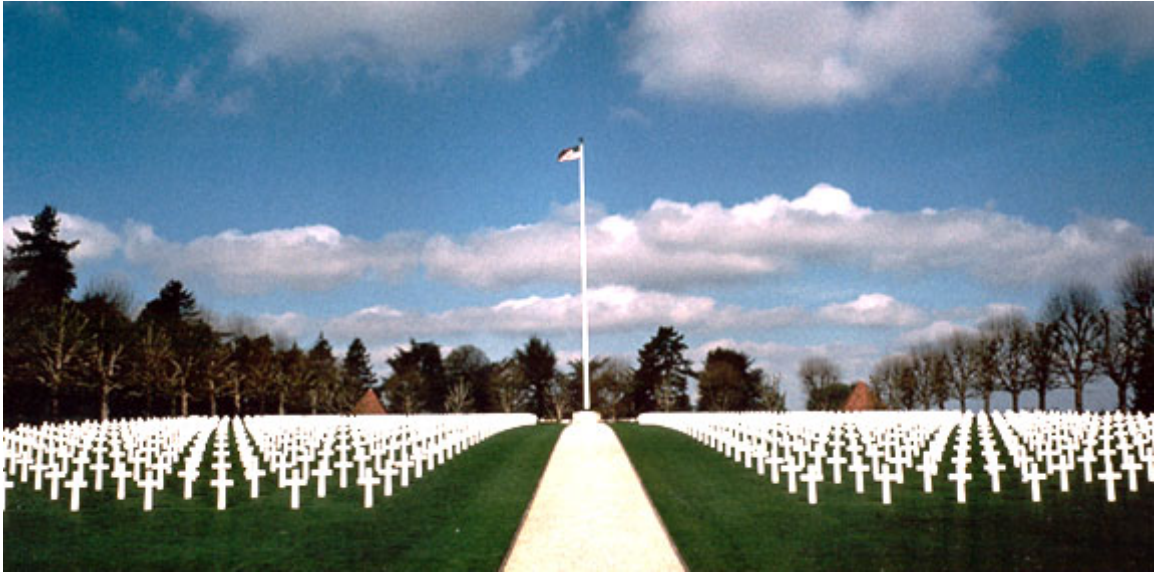
19. St. Mihiel, France - A total of 4,153 of our military dead.