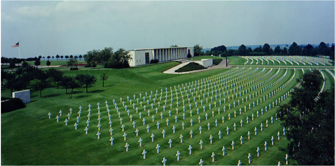
10. Lorraine, France. A total of 10,489 of our military dead