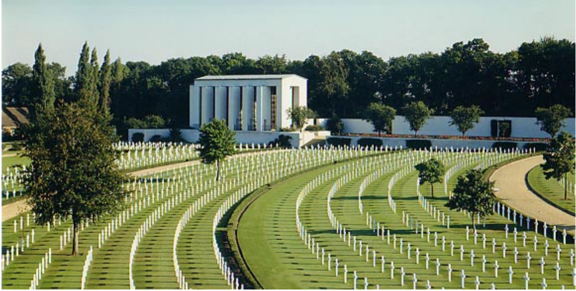
6. Epinal, France American Cemetery. A total of 5,525 of our Military dead