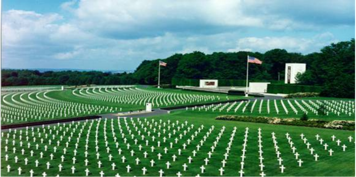
12. Meuse-Argonne. A total of 14,246 of our military dead