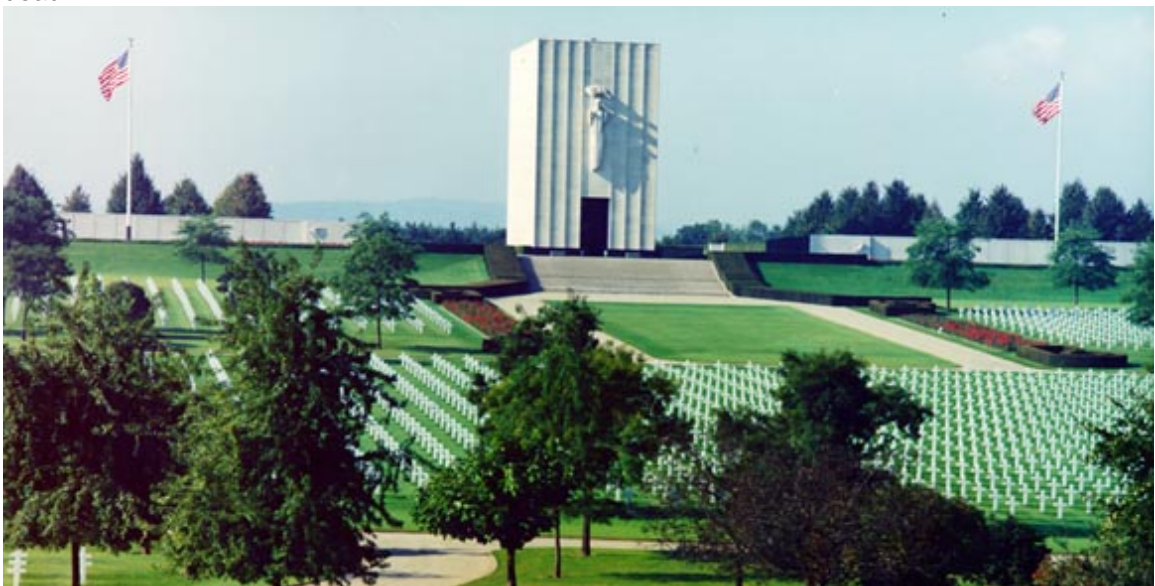
11. Luxembourg, Luxembourg. A total of 5,076 of our military dead.