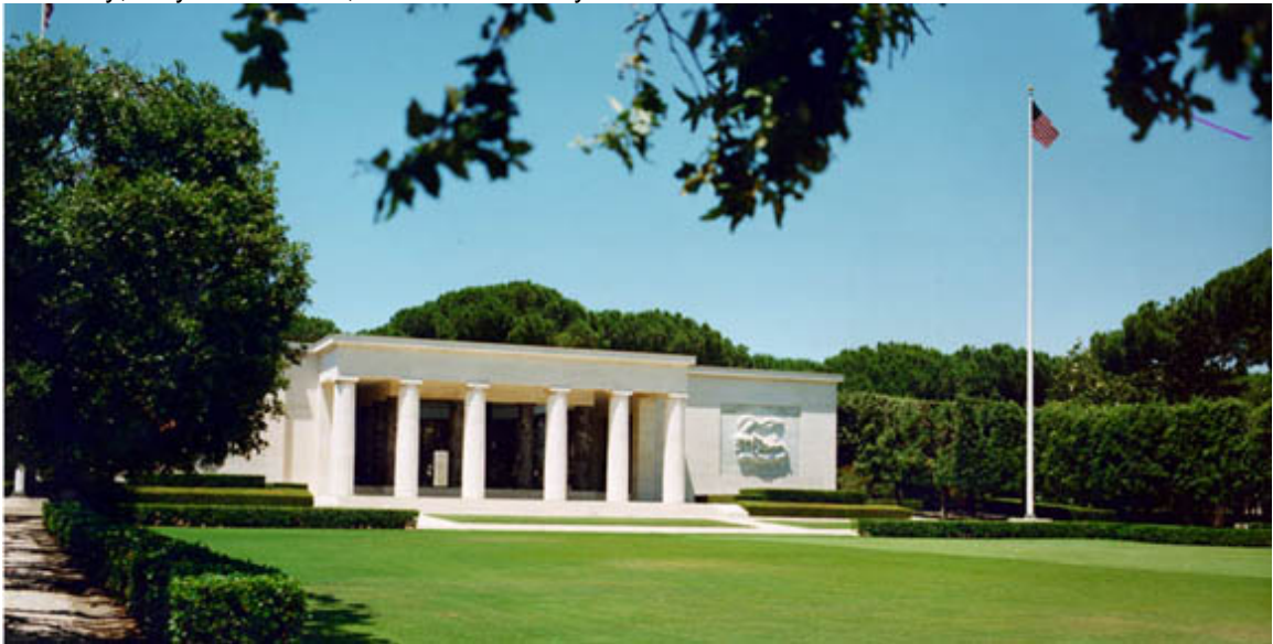
18. Somme, France. A total of 1,844 of our military dead