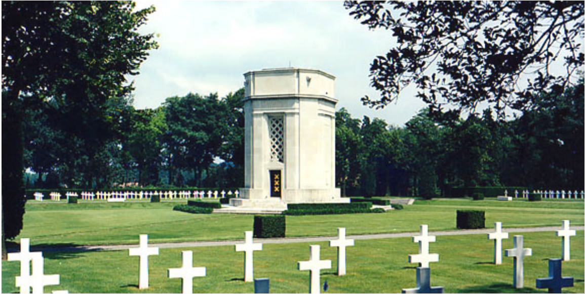
8. Florence, Italy. A total of 4,402 of our military dead.