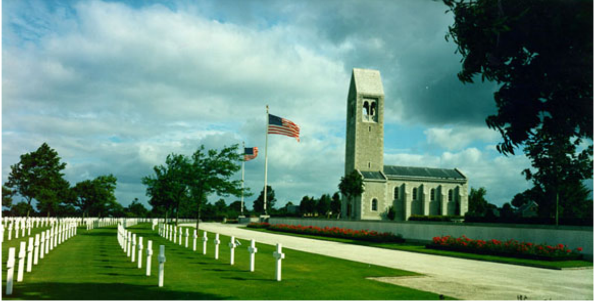
4. Brookwood, England - American Cemetery. A total of 468 of our dead